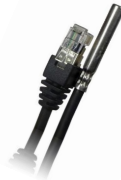
Sensors with RJ11/12 or RJ 45 connectors