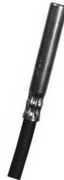
Sensors OK or OKS